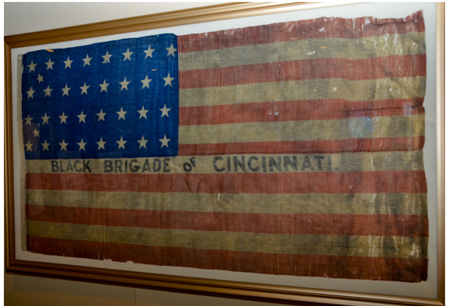
Black Brigade flag, exhibited at the National Underground Railroad Freedom Center in 2012