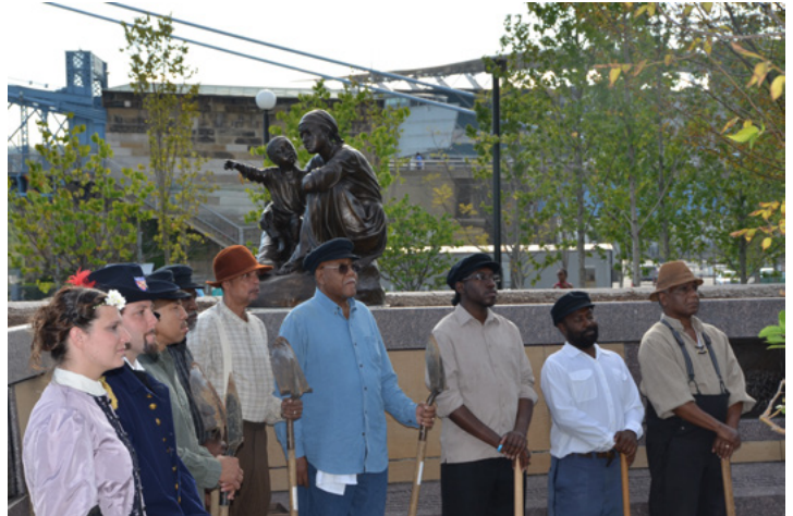
Commemoration of the 150th anniversary of Cincinnati's Black Brigade at Smale Riverfront Park, September 2012